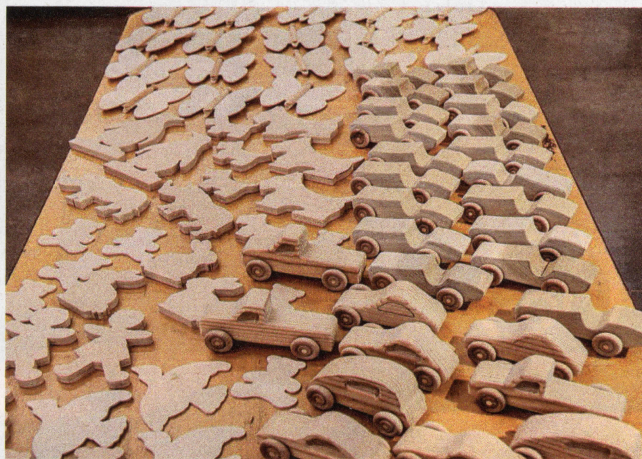
In about two hours, the St. Louis Woodworkers Guild and others built over 75 toys for donation to area hospitals.

The Guild began in 1994, and that's also when members began building toys and donating them to local children's hospitals. With 515 toys donated the first year,