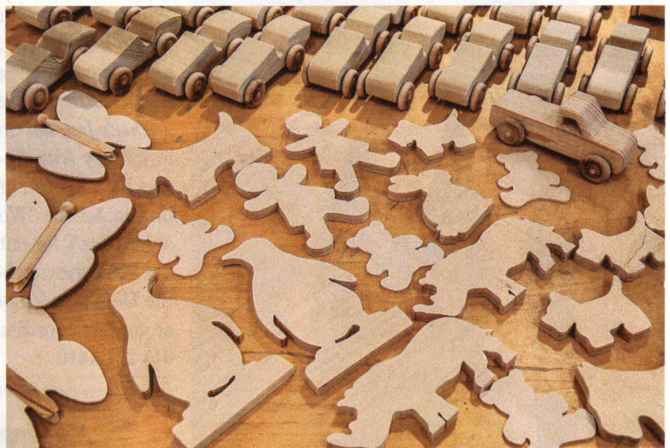
The toys are made from untreated wood, with the edges well-sanded. Most are left unfinished for further decoration by the recipients.

Further information about the St. Louis Woodworking Guild, including galleries of members' work, a library and additional resources, is at www.slwg.org .