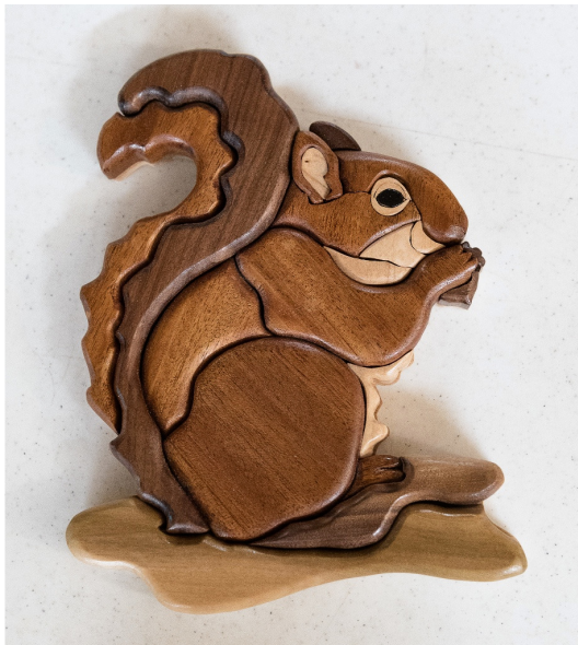
Scroll sawn squirrel by Al Carlson using walnut, mahogany and maple.